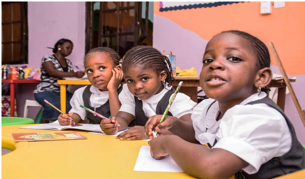
Figure 7: Pupils in the class

Nigeria is a signatory to the 1990 Jomtiem Declaration of Education for all by the year 2000 and also a member of the Group of E-9 nations committed to the total eradication of illiteracy. In spite of this, the nation's literacy rate is presently estimated to be 52%. Education statistics for 1996 shows that only 14.1 million children are enrolled in primary schools out of the 21 million children of school-going age. The completion rate was 64% while the rate of transition to Junior Secondary School was 43.5%. There is overwhelming evidence that these vital literacy indicators have not improved. This necessitated the need for a programme that would promote the realization of 'education for all' scheme in the country.