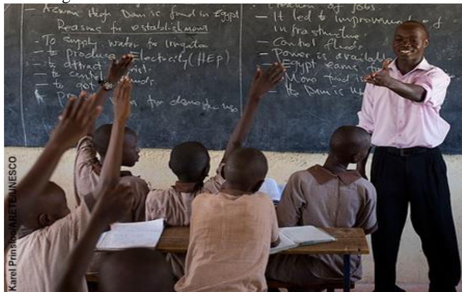
Figure 3: Teacher creating friendly learning environment with his voice and action

Besides that, he does everything meaningful to improve on his teaching. He even considers his voice a strategic natural appliance that can add some aesthetics to his teaching. He recognizes that the voice of the teacher has some influence on how effectively the pupil learns or fails to learn. He is aware that a coarse voice is repulsive to the pupil and a gentle voice is more appealing and inviting. I believe you can observe this in figure 3 below.