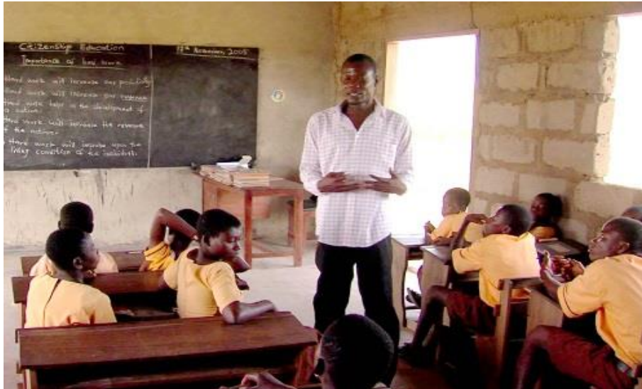
Figure 2: Teacher disseminating information in the Class

practice. The teacher knows his responsibility because he plans his teaching diligently often far ahead of the day of delivery. This enables him to reflect on the lesson and add the final touches before the day of presentation. In planning any lesson, he thinks about the pupil his age and his environment. He thinks about the content he wants to teach. He searches for reference materials to guide his selection of the content. As he reads the reference materials and gathers the content of the lesson, he critically reflects on them, and ensures that they are within the intellectual level of the pupil as you can see in figure 2.