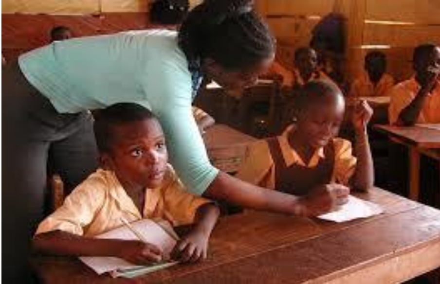
Figure 4: Teacher communicating effectively with children with patience

To surmount or cope with the mounting problems associated with children of primary school, the teacher should be energetic and physically fit, patient, kind, caring, loving, but firm. He should be able to understand the child i.e. has good knowledge of the child's mind and how it works. The teacher should create a happy atmosphere in the class and interact with them freely. He could do this by involving them in class discussions, taking imagination, engaging them in drama and quiz.