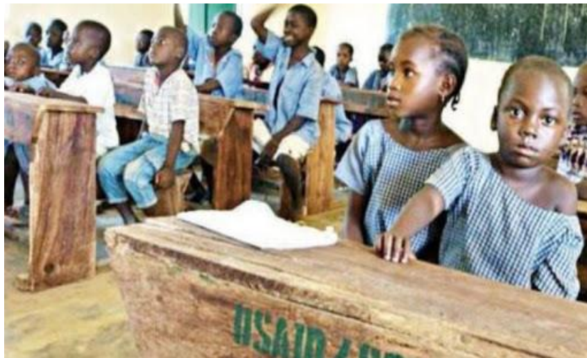
Figure 6: Pupils in the Class

Primary education is the education given to children in the first six years of school as you can see in figure 6. It is for the children between ages 6 and 11.