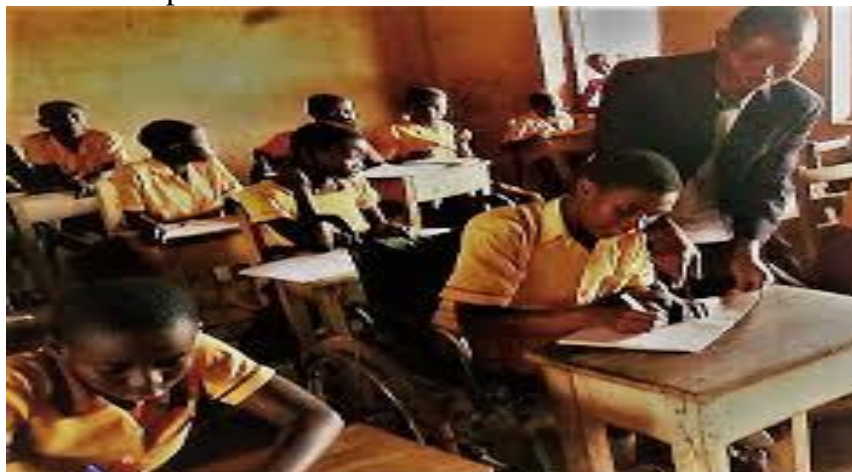
Figure 1: Teacher’s Role in Guiding Learning

The teacher has many roles to play in the upbringing of the child. As a resource person, his main functions are to guide learning as you can observe in figure 1 below. He is to provide enriched educational environment and expose the child to a variety of learning experiences in order to help them unfold the hidden talents in them.