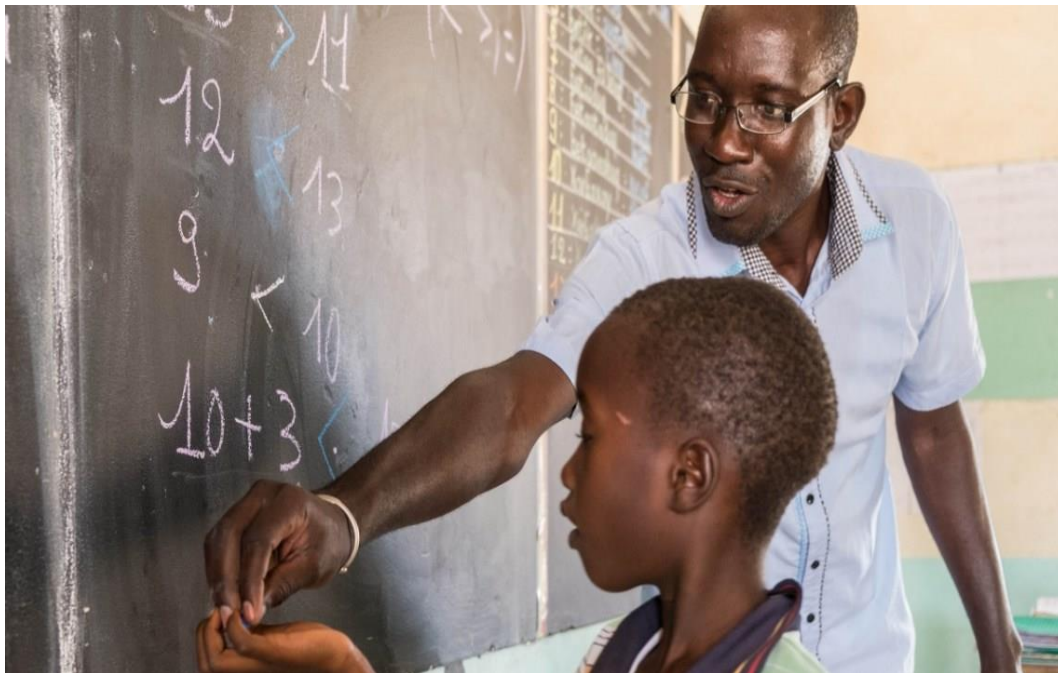
Figure 5: Teacher encouraging pupil to learn and practice

The teacher of the great personality has some distinct qualities in facilitating the learning of children. He is an inevitable factor in the children's development that is the teacher has the most fundamental, far reaching and direct influence on the children. He knows his responsibility because he plans his teaching diligently often far ahead of the day of presentation. In planning he thinks of the pupils, their age and their environment. He thinks also about the contents, he wants to teach and searches for reference materials to guide him in the preparation of the lesson. All the strategies which the teacher employs in the classroom enhances the general atmosphere of life in the classroom thus encourages the children to learn optimally either individually or collectively as we have in figure 5.